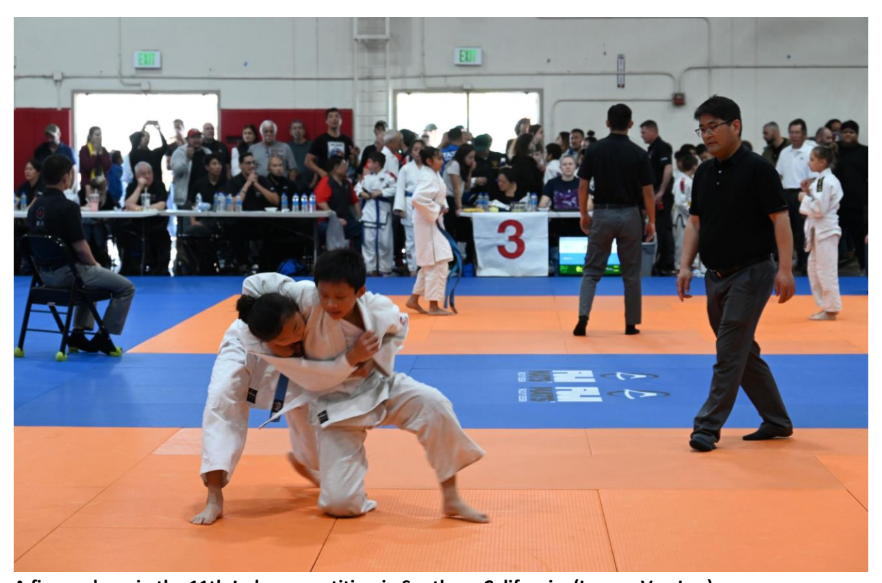
A fierce phase in the 11th Judo competition in Southern California.

WESTMINSTER, California (NV) – The 11th Judo Competition organized by the Taishi Judo Club opened at Westminster High School in the city of Westminster on Sunday, March 13, bringing together many people. Candidates from teenagers to adults from all over the world come to compete.